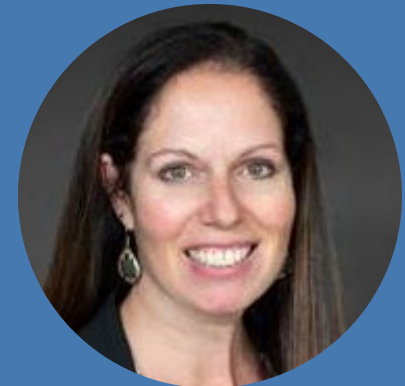
Commissioner Darcie L. Houck