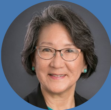
Commissioner Genevieve Shiroma