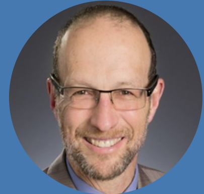
Commissioner Clifford Rechtschaffen