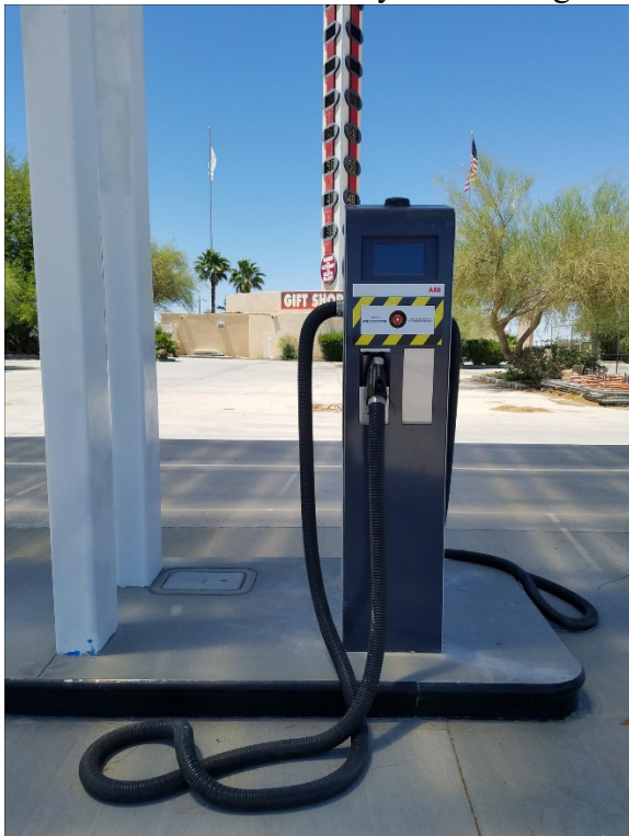
ABB prototype charger.

The (2) ABB prototype high-power charge posts were not commissioned in Q3 2018 because there was concern around the connector used on the prototypes. The connector had an issue previously so despite installing the 150kW charger, EVgo decided out of an abundant concern for safety not to energize the prototype with the connector in question.