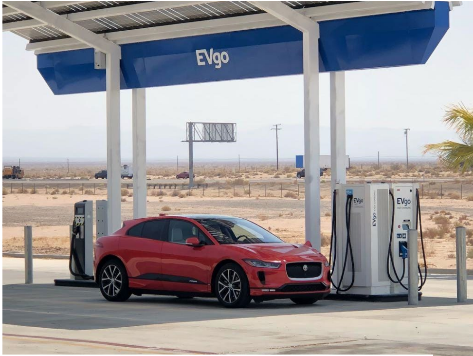
Jaguar I-PACE charging at 50 kW charger at the Baker site.

The (2) ABB prototype high-power charge posts were not commissioned in Q3 2018 because there was concern around the connector used on the prototypes. The connector had an issue previously so despite installing the 150kW charger, EVgo decided out of an abundant concern for safety not to energize the prototype with the connector in question.