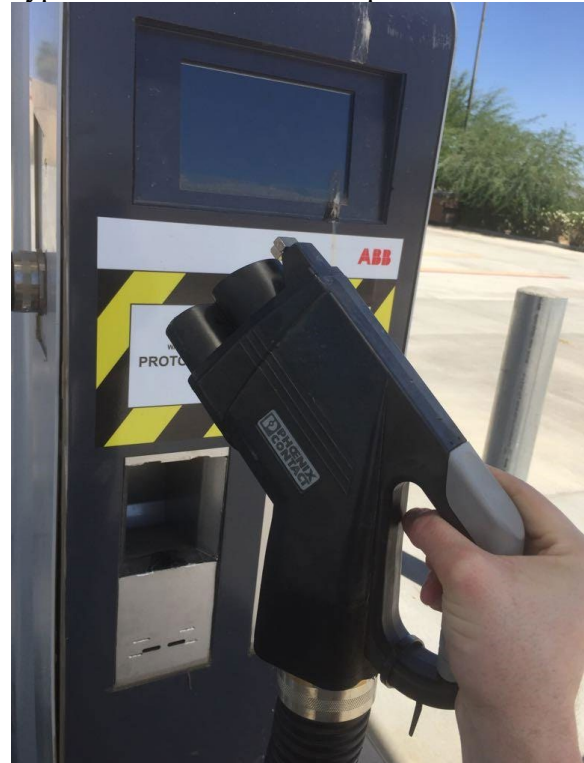
Phoenix Contact connector on prototype.