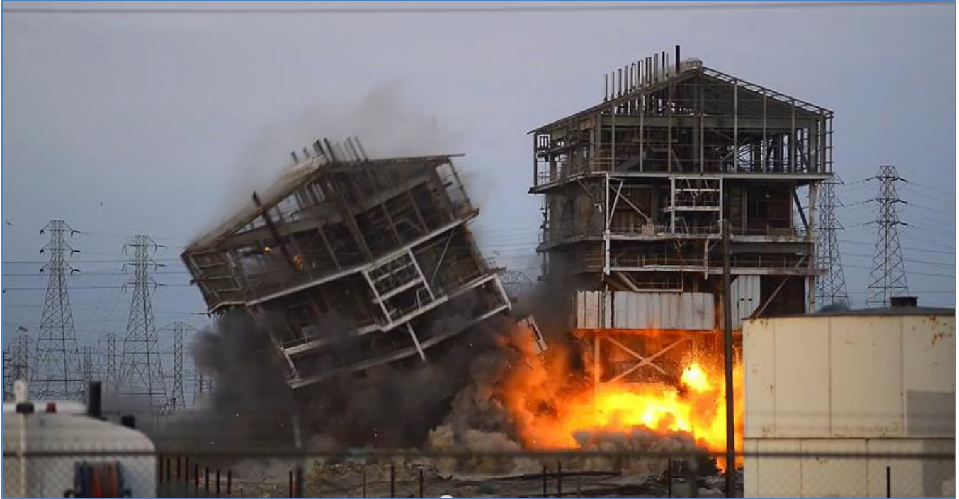
Photo 1: Kern Power Plant Boilers Implosion.