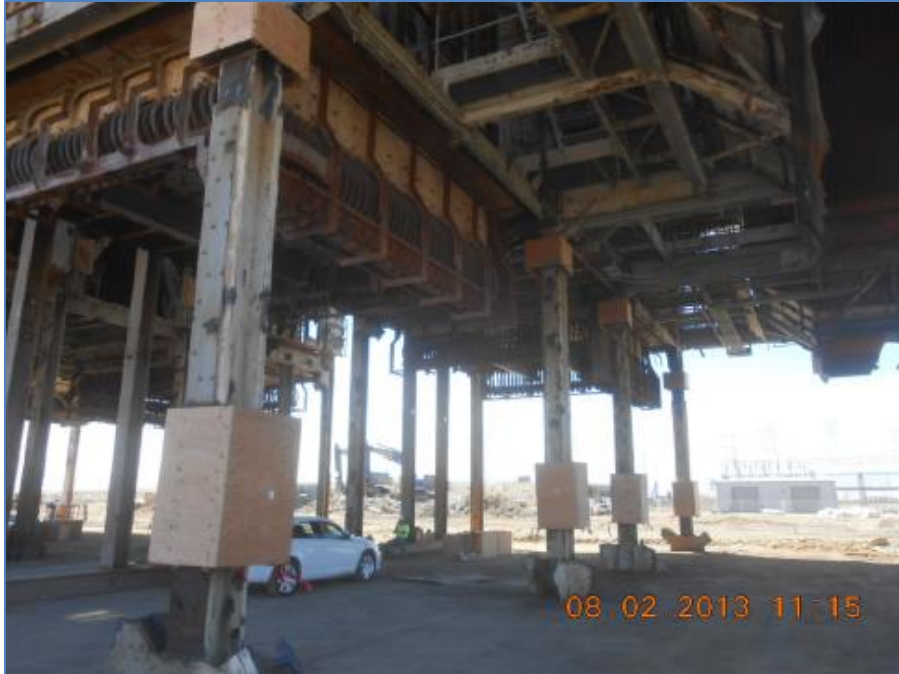
Photo 6: Plywood boxes installed over LSC and kicker charge to contain flying debris.

And finally, Demtech failed to consult an engineer or use computer modeling to simulate the implosion. A structural or metallurgical engineer could have offered crucial insights regarding the structural integrity or mechanical properties of the support columns, which Demtech could have used to change or at least scrutinize its implosion design. However, Demtech failed to confer with subject matter experts, and further failed to use computer modeling tools that are widely available to simulate and validate its implosion design.