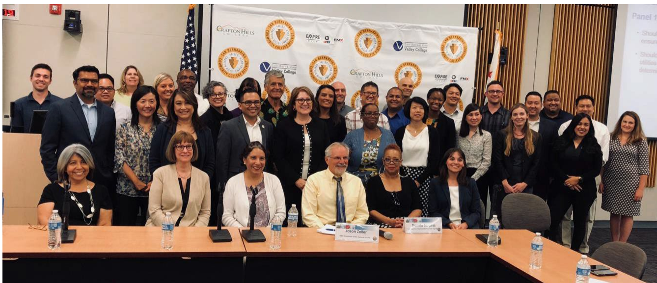
Image 5: Community Meeting regarding Disconnection in San Bernardino. June 2019.