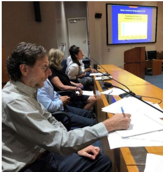
Image 3: Representatives from Community-Based Organizations discuss the need for in-language outreach. September 2019.