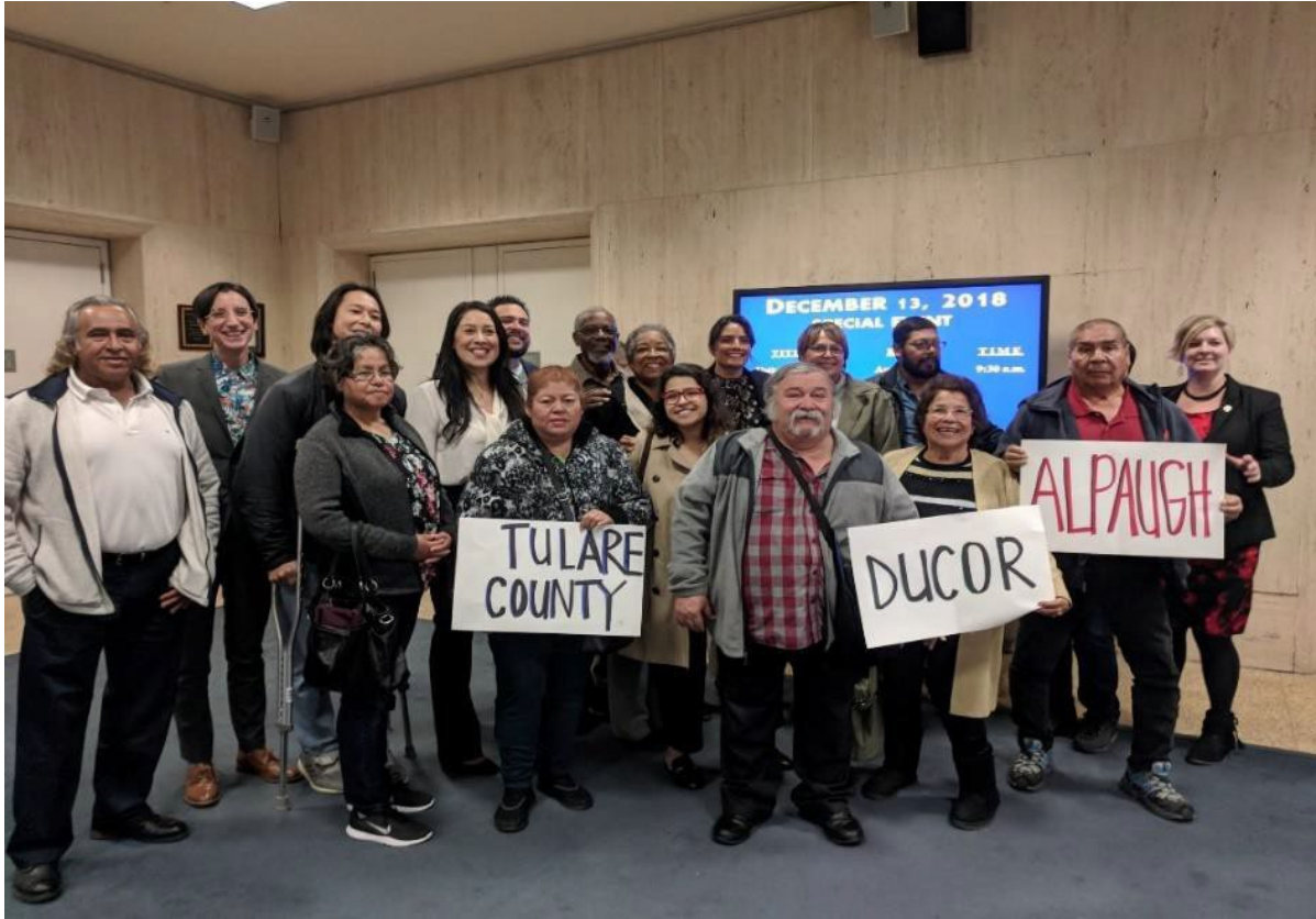
Image 2: Residents from the San Joaquin Valley attend CPUC Voting Meeting, December 2018.

Burden but do not receive an overall CalEnviroScreen score 20, 21 ; all Tribal lands 22 ; low-income households 23 ; and low-income census tracts 24 .