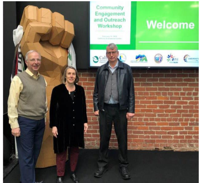
Image 4: CPUC staff attend a Community Engagement and Outreach Workshop in Sacramento. February 2020.