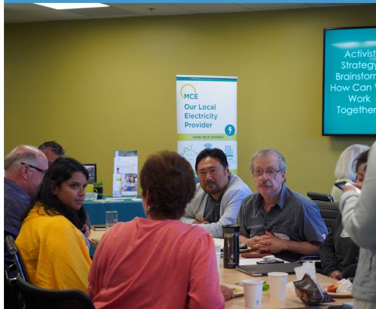
Below: 2019 Community Power Coalition training and workshop.