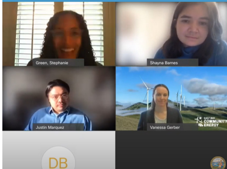
Below: MCE hosts the October 2021 CPUC and Joint Utilities Virtual Small and Diverse Business Expo