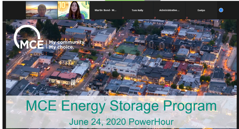
Above: MCE's 2020 PowerHour on Energy Resilience.