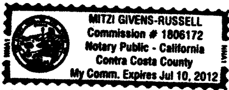
Place Notary Seal Above

Signature [Handwritten Signature] Signature of Notary Public